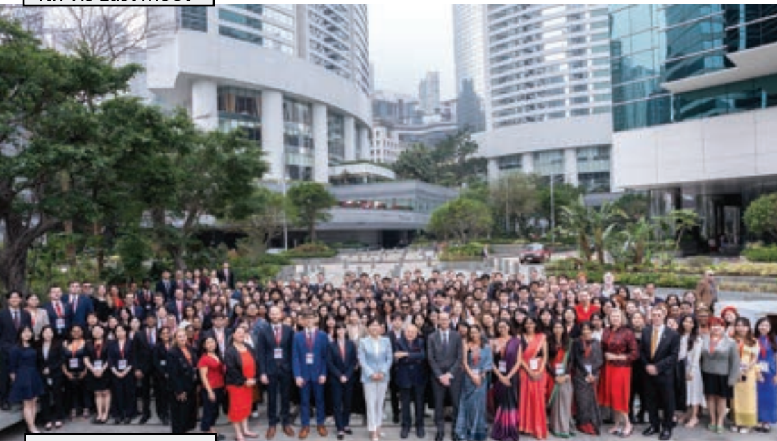
21st Vis East Moot