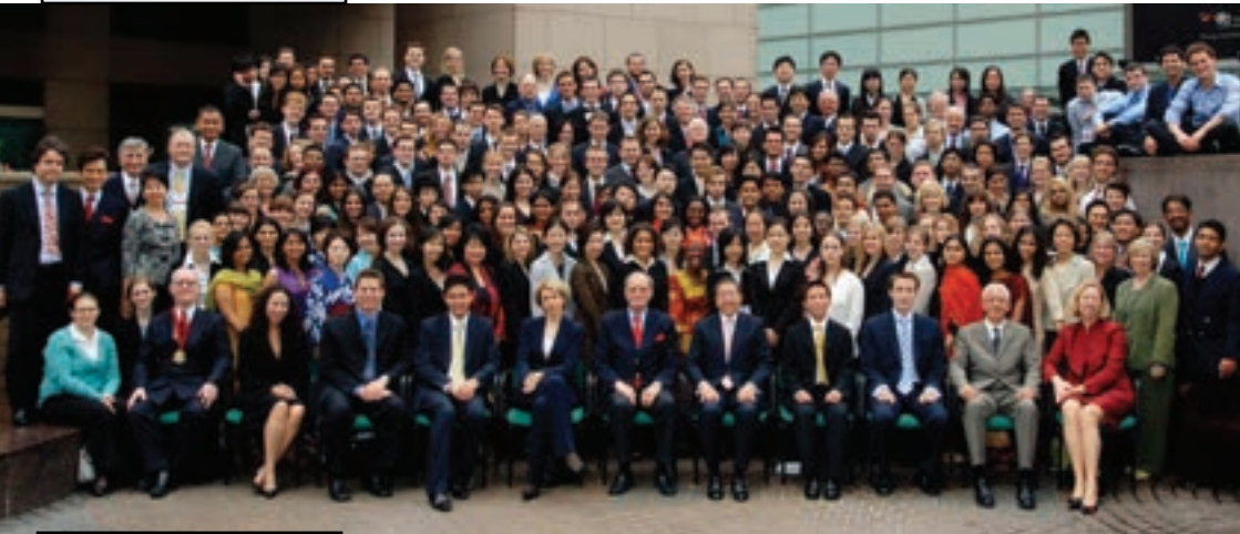
4th Vis East Moot