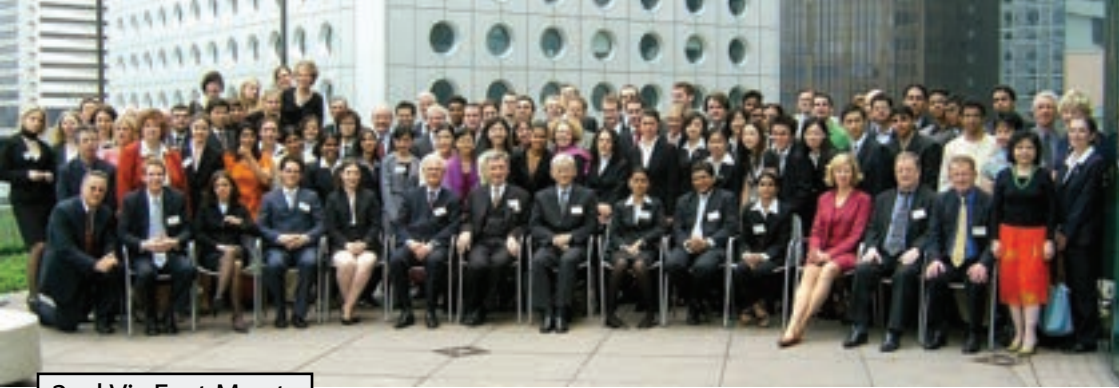
2nd Vis East Moot